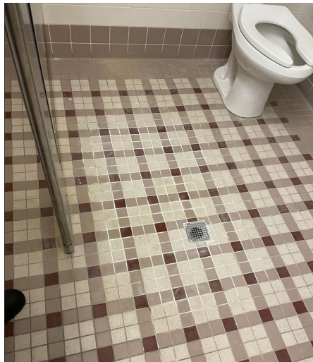
Newly repaired floor drain