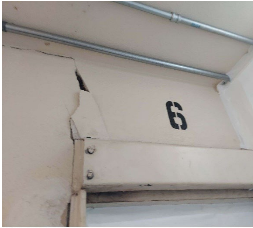
Deteriorated and buckled wall