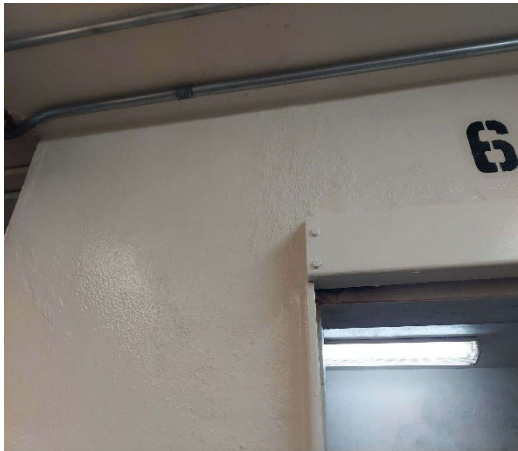
Newly repaired/painted wall