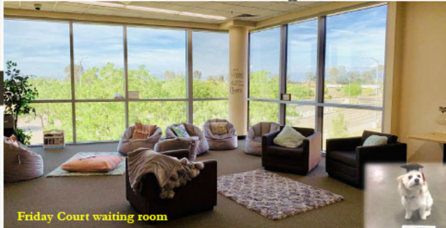
Friday Court waiting room