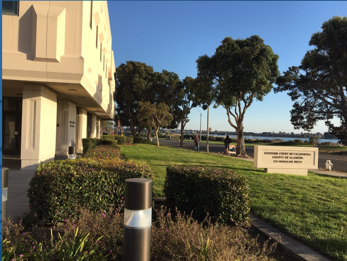
Alameda Courthouse exterior