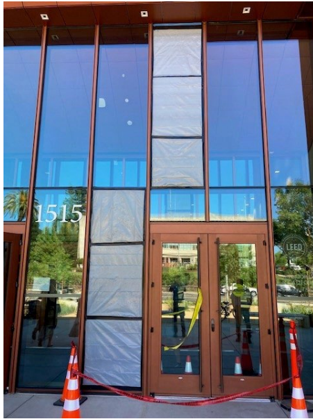
Shattered first-floor windows at public entrance