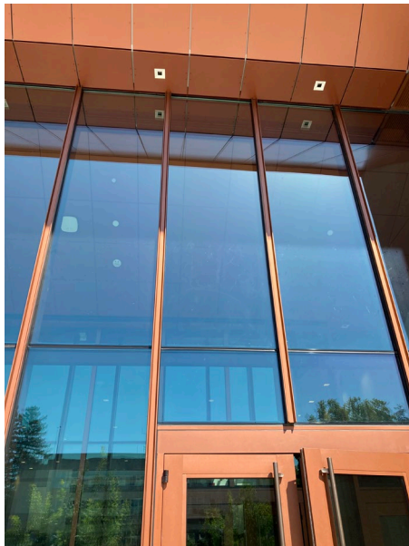
Newly replaced tempered glass windows at public entrance