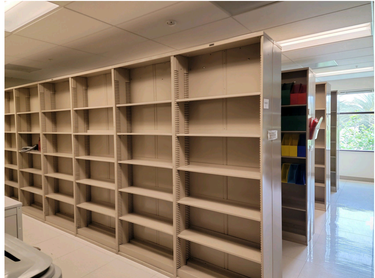
Fourth District, Division Three