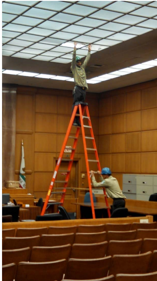
Figure 2: Energy-efficient Lighting Project at Stanley Mosk Courthouse