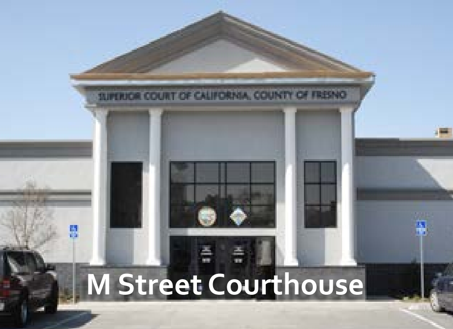
M Street Courthouse