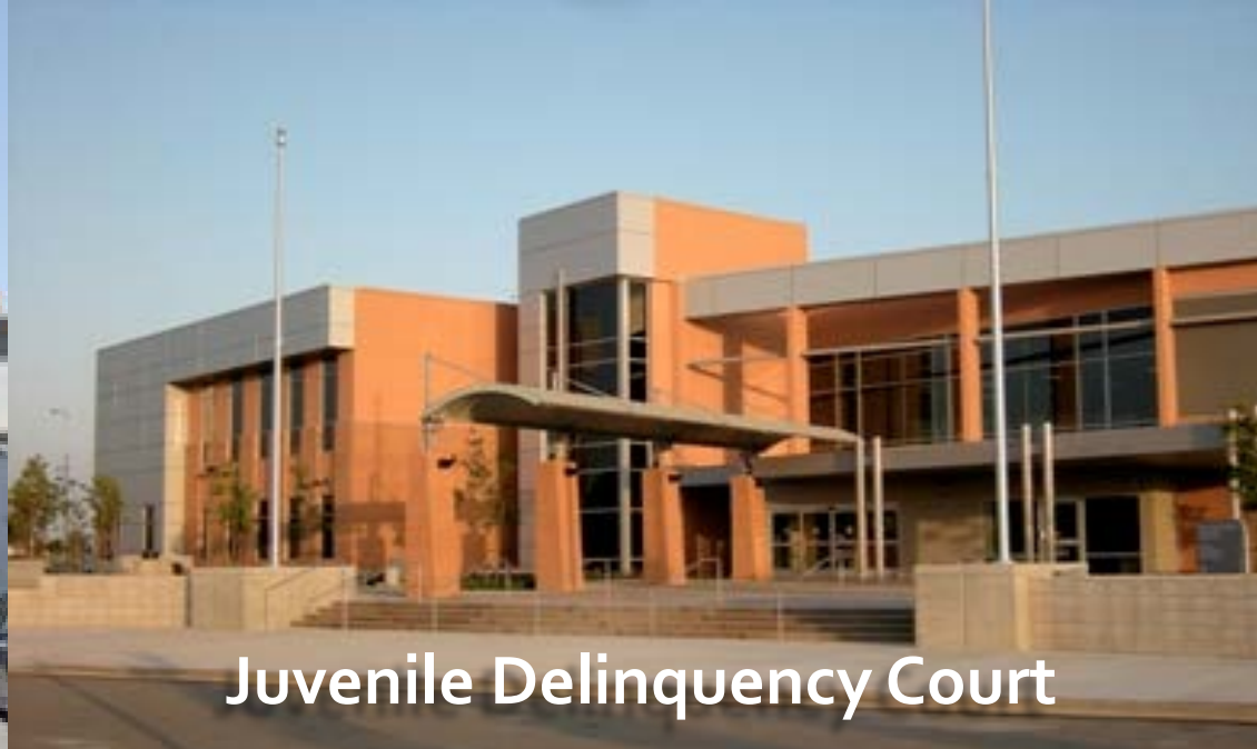
Juvenile Delinquency Court