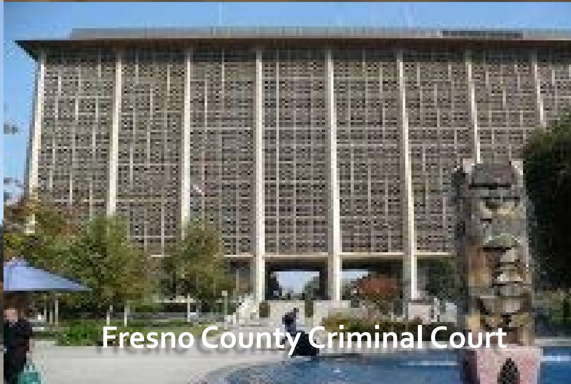
Fresno County Criminal Court