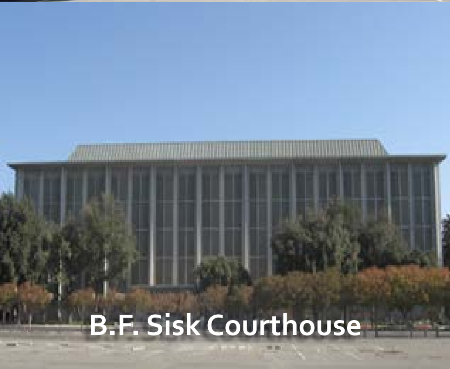
B.F. Sisk Courthouse