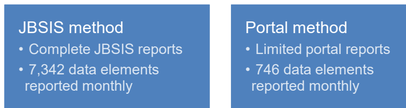
Figure 3: JBSIS 3.0 Methods of Reporting

As of April 2022, only 27 California trial courts have been able to provide complete JBSIS data. Other courts—courts with limited data extraction capabilities due to technological constraints,