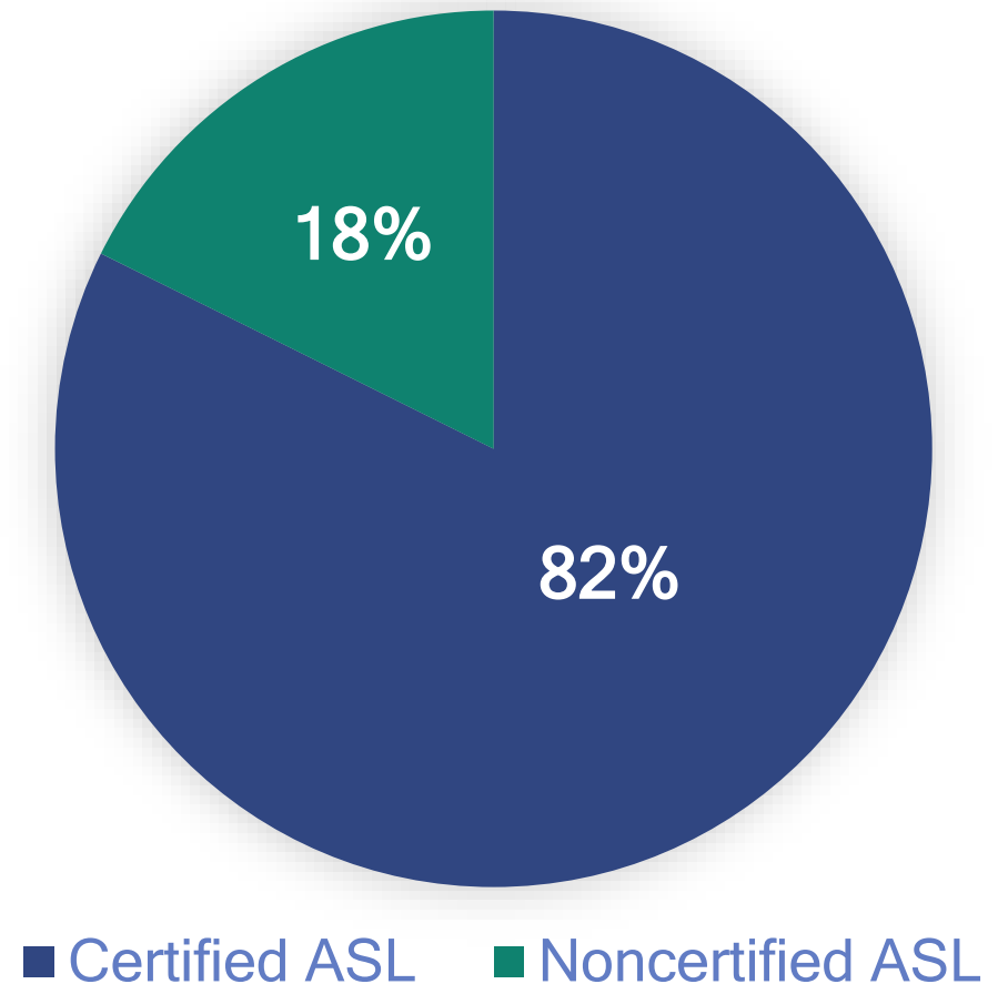
ASL Interpreted Court Events FY 2020-24